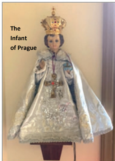
The Infant of Prague

In the 17 th century, Mother Mary of Vailankanni appeared to a lame young boy in Vailankanni, India, and instructed him to find a certain Catholic man in the town and tell him to build a church in her honor there. Apparently cured, the boy ran to town and told his story. The Catholic men of the village built a thatched chapel dedicated to Mary under the title of "Our Lady of Good Health." Pope John XXIII elevated the rebuilt church on the site to a minor basilica in 1962 and noted that pilgrims in large numbers had been visiting the shrine for many years and that it was hailed as the "Lourdes of the East."