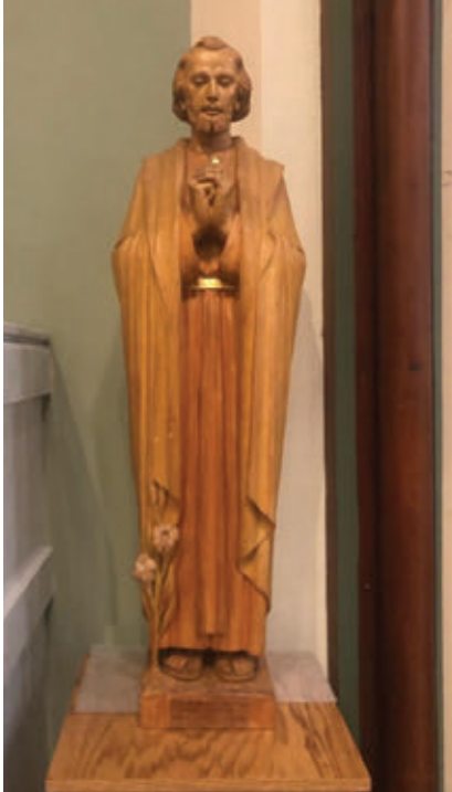
Statue of St. Joseph recently placed in the sanctuary of St. Ann's at the wall near the pulpit.