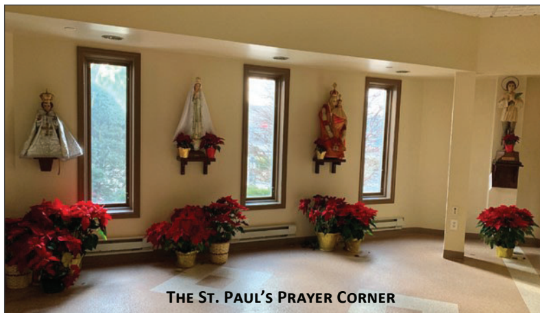
THE ST. PAUL'S PRAYER CORNER