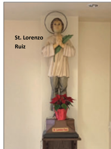
St. Lorenzo Ruiz