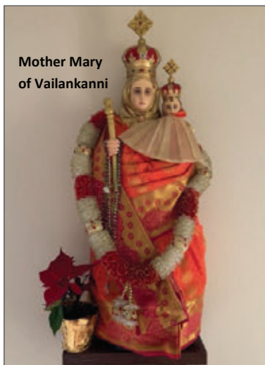
Mother Mary of Vailankanni